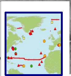
OceanSITES North Atlantic Network

Numerous North Atlantic time series data is available (see http://www.oceansites.org/ and http://www.eurosites.org/ for a more complete list) and can be used for model validation. It is surprising that the data has so far not been systematically used for model data assessment. One main reason for this, we suppose, is the difficulty in accessing the data. As heterogeneous as the initial motivations (and funding) of the observatories was as was the data dissemination policy. All time series sites discussed here are part of recent European projects (EuroSITES, THOR and ESONET). Besides support to the infrastructure the recent projects put forward the process in harmonization and standardization of the data.